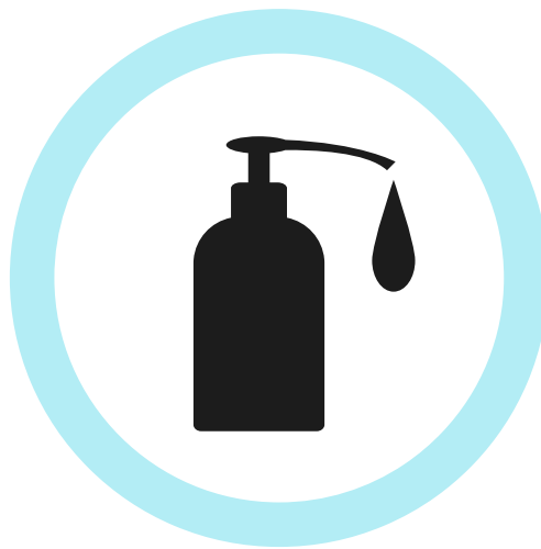
Use Soap or Hand Sanitizer